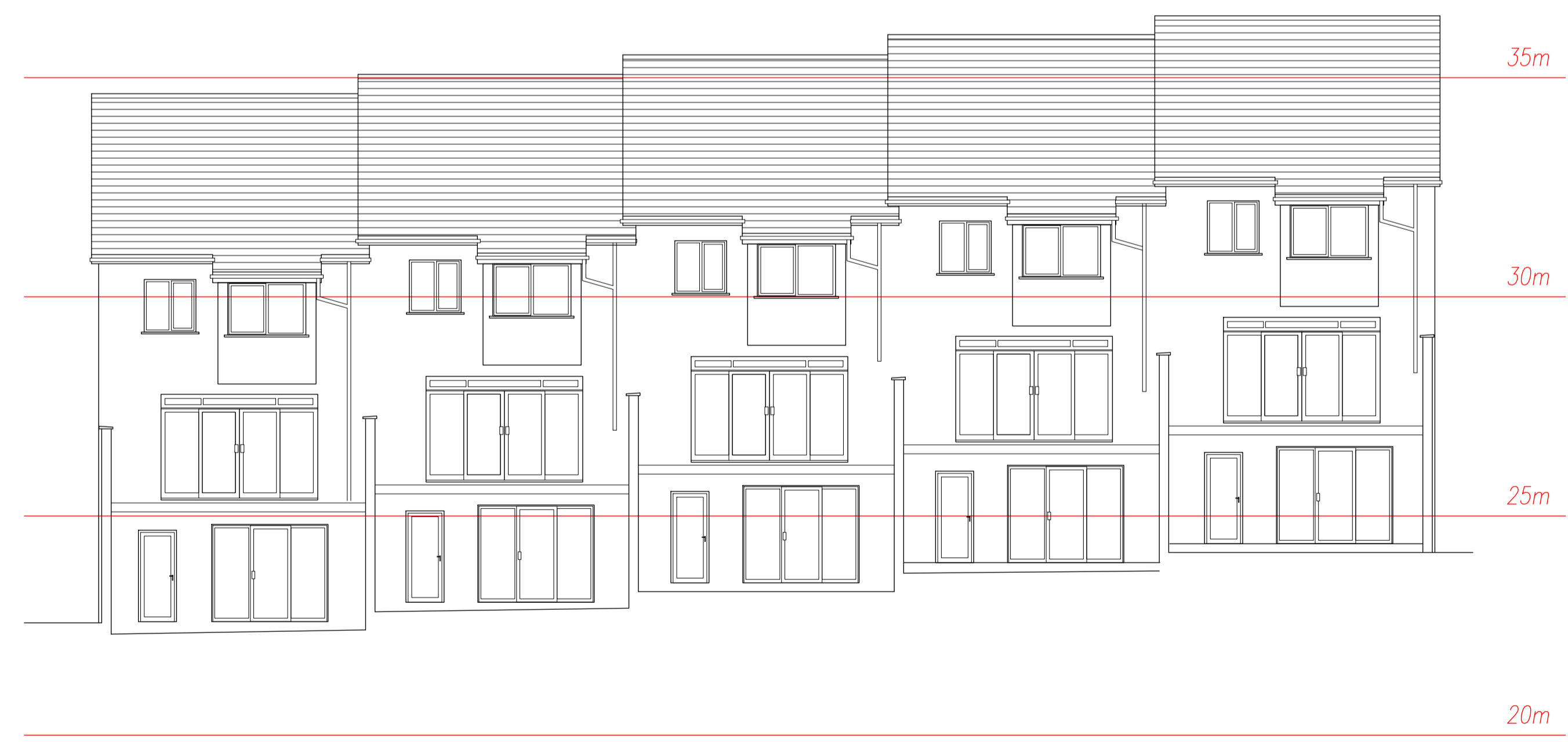
EXISTING WEST ELEVATION 1:100@A1