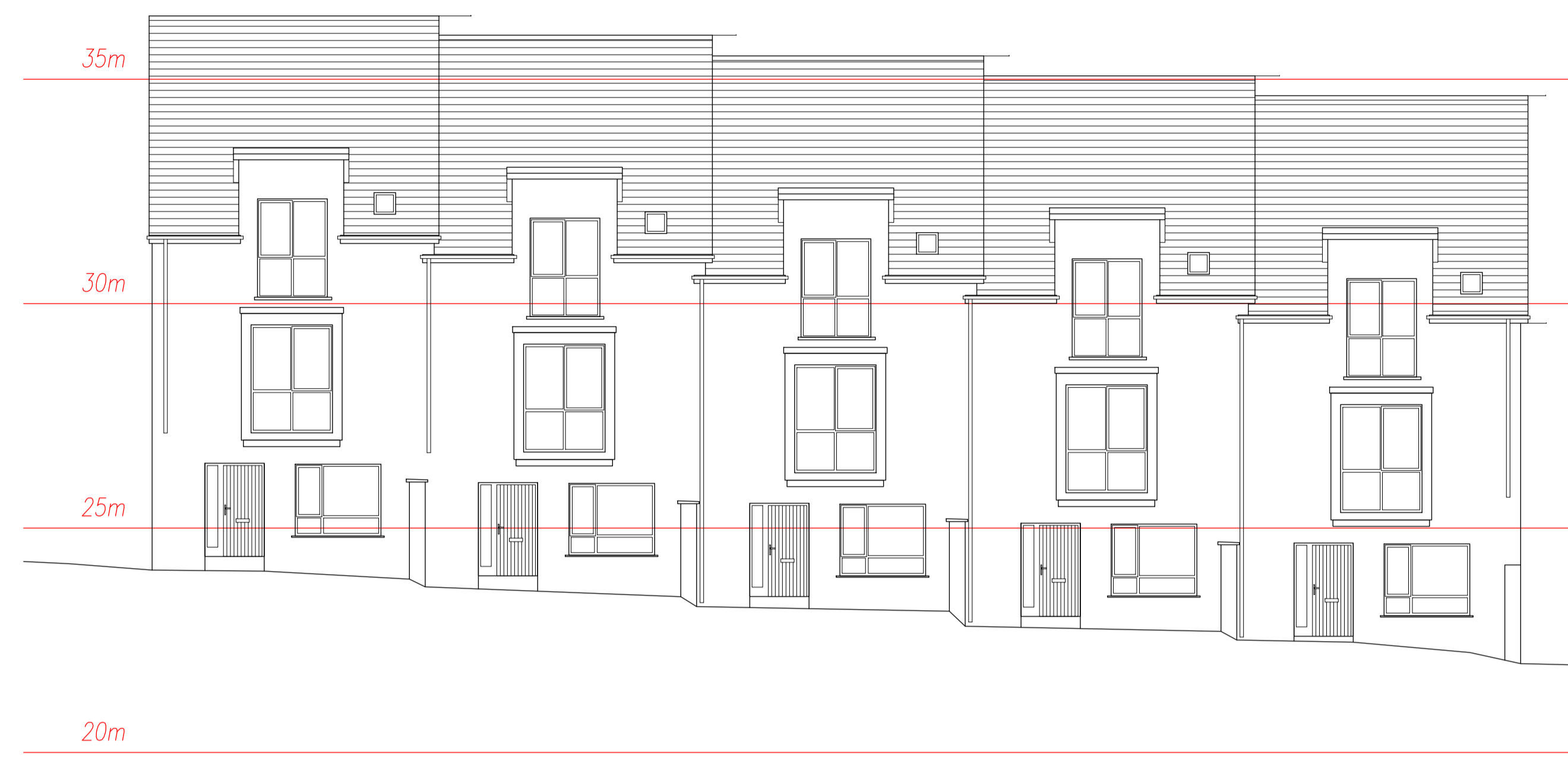
EXISTING EAST ELEVATION 1:100@A1